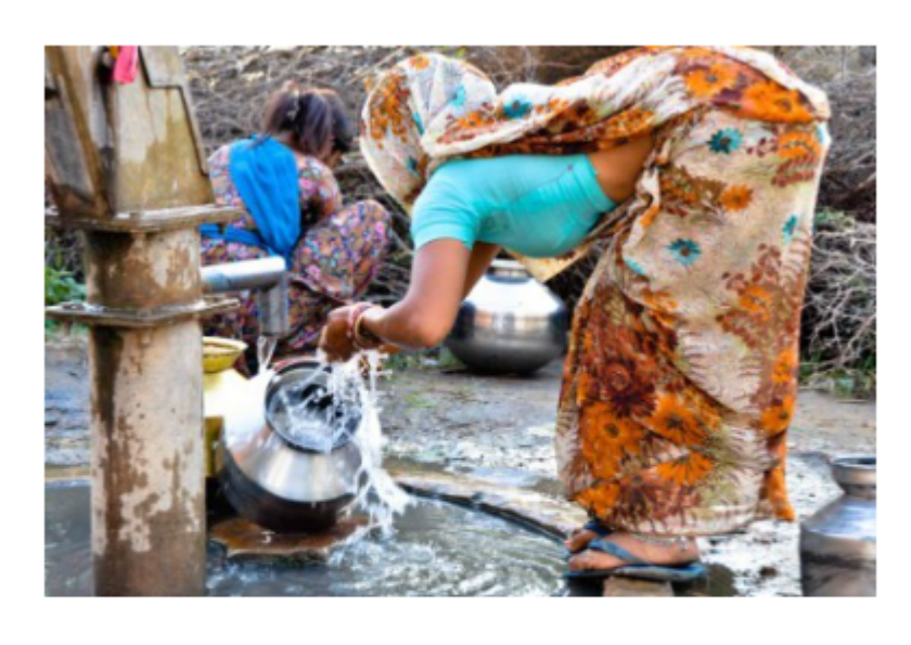
The MGM Collaboration Project, India