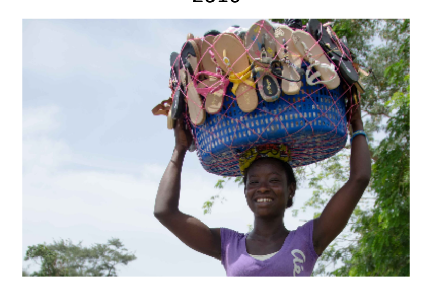
Ridge Hospital, Accra, Ghana